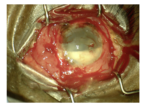
Fig. 1. Intraoperative photograph demonstrating the presence of a new hypopyon with fibrin in the anterior chamber and a plaque surrounding the superotemporal Baerveldt tube.

Rohowetz et al.: GDI-Associated Endophthalmitis due to Agrobacterium radiobacter