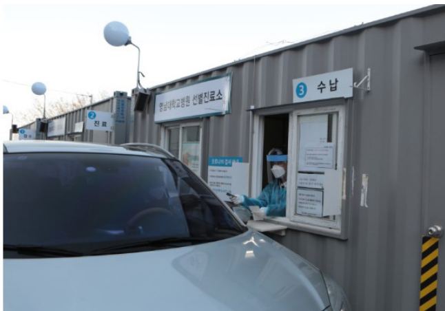
Fig. 4. Payment using a credit card.