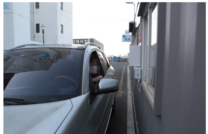
Fig. 3. A two-way microphone is used during communication between an individual and a doctor. The doctor and individual view one another through the window and talk via the microphone.

After this screening, the doctors decided whether the individual needed to be tested, whether a nasal and throat or sputum test should be performed, and whether insurance would cover the testing. The test was then prescribed, and if covered by insurance, the physician completed a document called an “infectious patient report” online and sent it to the KCDC. The doctors asked the individuals questions through two-way microphones, and there was no contact between them (Fig. 3). Therefore, the risk of coronavi-