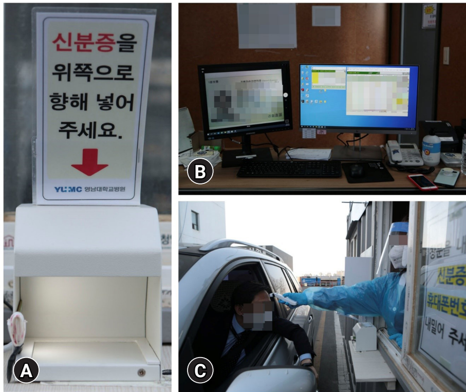
Fig. 2. Step 1. (A) Identification (ID) card scanner (description in Korean: “Please insert the ID card with photo-side up.”). (B) A scanned image of the ID card on a computer monitor. (C) A noncontact forehead thermometer was used to measure an individuals’ body temperature.