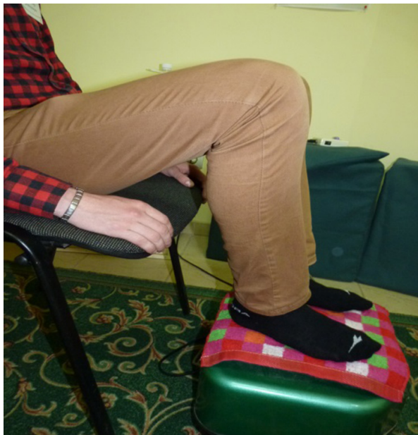
Figure 1: A patient sitting in a chair with feet soles positioned on the vibrating platform.

pressure measurements. The arm cuffs were positioned at 2 cm above the elbow of the left hand. In order to increase the accuracy of blood pressure measurements, they were conducted as follows. The pressure was measured twice before vibratory massage session in intervals of 2 minutes. The Interval was necessary to restore blood circulation in hand after the first measurement. The obtained results were averaged. Patients had rested on a chair for 5 minutes before the first pressure and heart rate (HR) measurements were conducted. The measurement of blood pressure and heart rate was repeated right after the completion of vibratory massage. It was noted that within 5 minutes after the massage, blood pressure and heart rate returned to its previous normal values. This measurement protocol was chosen after preliminary studies. Processing of results was conducted in MS Excel 2010 (Redmond, WA, USA).