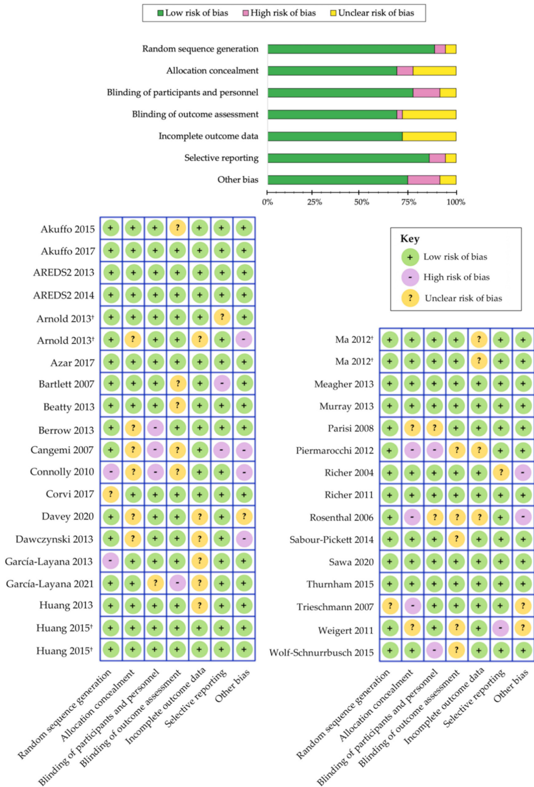
Figure 3. Cochrane Collaboration’s tool for assessing risk of bias in randomized controlled trials [185]. Separate publications are indicated with a symbol (†) next to author name.