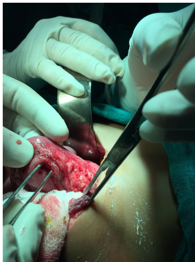
Fig. 2. Per-operative photograph showing an iatrogenic perforation of about 1.5 \times 1.5 cm on the greater curvature of the stomach (the tip of forceps in the perforation).

Congenital diaphragmatic hernia (CDH) is described as (1) failure of diaphragmatic closure at development, (2) presence of herniated abdominal contents into chest and (3) pulmonary hypoplasia. It occurs in about 1 in 3000 live births and results from the failure of different parts of diaphragm to fuse resulting in patent pleuropertoneal canal in embryonic life [7]. Another conjecture is that if the development of lung bud is disturbed, there is an impaired development of a post hepatic mesenchymal plate (PHMP) that is closely related to the development of lung, resulting in a defective diaphragm [8]. In diaphragm, the defects are usually present in posterolateral part (Bochdalek hernias, 70–75%)