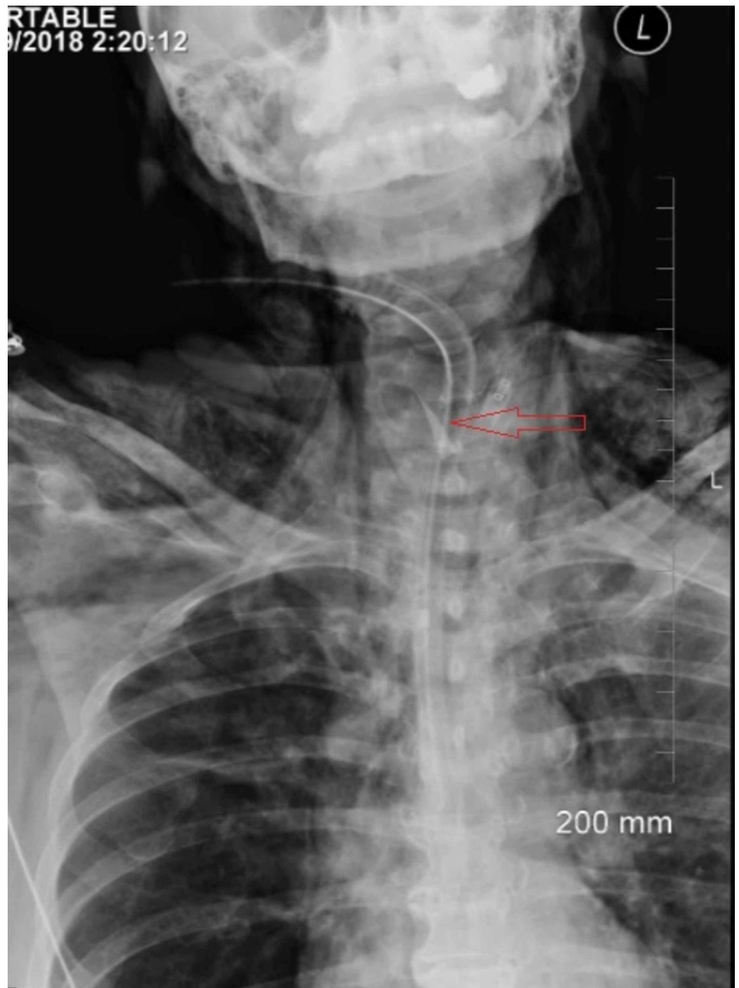
FIGURE 1: Chest X-ray anteroposterior view showing scalpel blade (labeled)