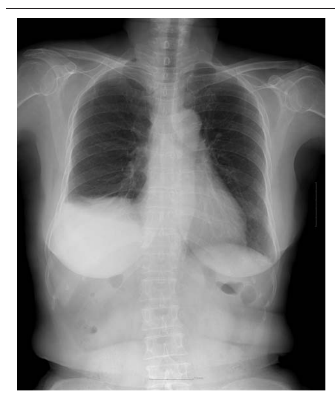
Figure 2. Chest X-ray at 3 months showing an elevation of the right hemidiaphragm associated with basal atelectasis of the right lower lobe and pleural effusion.

HDP from ipsilateral phrenic nerve block is a well-known side effect of ISB. When using the single-injection technique, ISB is associated with a 100% incidence of HDP, which can result in a 25% to 32% reduction in the spirometric measures of the