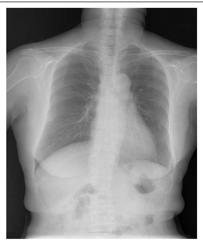
Figure 1. Preoperative chest X-ray.

rapidly disappeared, a 20-gauge end-hole catheter was inserted caudally by 8cm through the cannula into the plexus sheath without dysesthesia or pain. Subsequently, 30 mL of 0.5% ropivacaine were slowly injected through the catheter after careful intermittent aspirations. Thirty minutes after the initial bolus, the patient exhibited a sensory and motor blockade without any subjective increase in breathing efforts. The catheter was then tunneled subcutaneously by 3 to 4 cm through an 18gauge IV needle and was fixed to the skin with a tight suture. The patient was placed in the beach chair for the surgery. Her head was firmly fixed in the neutral position with a strap. A propofol infusion was administered intraoperatively for sedation. The 195 minutes of surgery was uneventful. In the recovery room, a 0.2% ropivacaine infusion was administered through the catheter at a rate of 6 mL/hour with a 3-mL bolus and a lockout of 20 minutes. The patient showed excellent analgesia and required no supplemental analgesics.