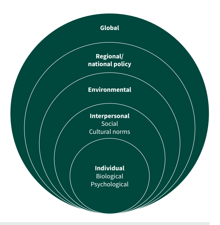
FIGURE 3 Model of determinants to physical activity. Information from BAUMAN et al. [22].

Concerns about respiratory symptoms, fear of exercising and movement, and lack of belief in the individual's capabilities to exercise or partake in physical activities all lead to physical inactivity and prolonged sedentary behaviour [41]. These factors also negatively impact exercise capacity regardless of respiratory disease severity. For example, people 7–14 days post-onset of an exacerbation of COPD adopt sedentary behaviours due to the low perceived capability and self-efficacy of performing physical activity, limited understanding of the disease and physical activity concepts, lack of transference from health