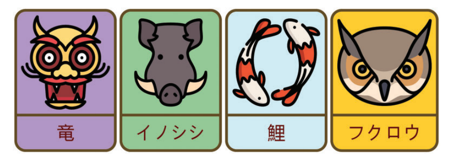
Figure 1. Examples of cards from Shinpo.

Even though Shinpo deliberately uses specific thematic and abstractions – shrines and card game references – hoping to appeal to Japanese (elderly) people, the rationale behind the design is that collecting items is a widely enjoyed activity by people of different cultures, especially seniors. More importantly, this basic mechanism can be adapted in all elements of the tetrad, since it can be easily transported to different cultural contexts (e.g. zodiac signs instead of animals or coins instead of cards); different rules and interaction strategies (e.g. cooperation, competition, challenges, hierarchies); different visual styles (e.g. traditional, cute, cartoonish) and different technologies (e.g. physical objects, IoT devices). These adaptations, when limited within a closed context,