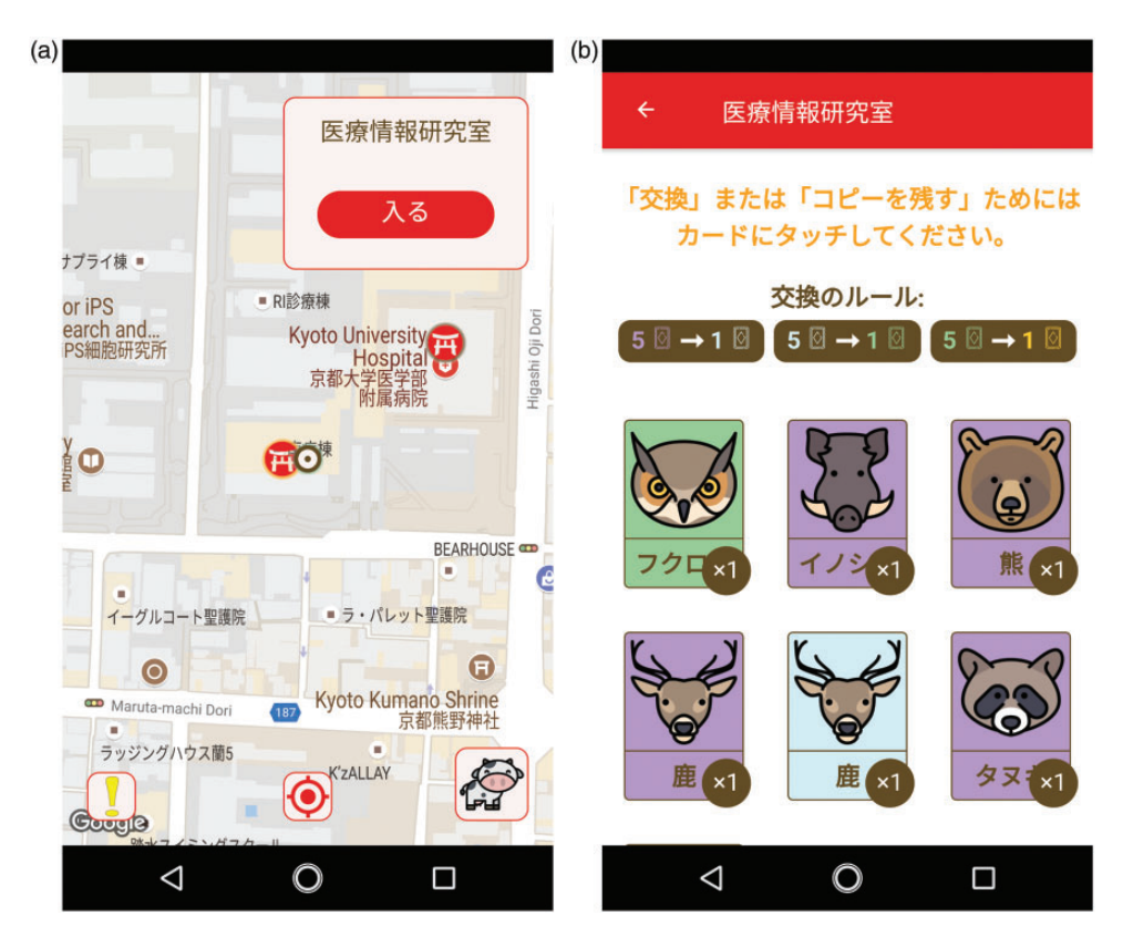
Figure 2. Screens from Shinpo: (a) world map and (b) hotspot.

could also be presented simultaneously to different groups of players to control for their specific experience. For instance, the colour schemes or the illustration style could be changed and evaluated for their appeal to different audiences: different players could see different colour schemes or different styles, either statically, based on profiles set a priori, or dynamically, based on information such as location, time or weather.