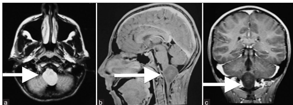
Figure 1: Preoperative magnetic resonance image: showing a cervicomedullary intra-axial lesion; (a) Axial section in T2 signal intensity sequence. (b) Sagittal slice in T1 intensity sequence. (c) Coronal section in intensity sequence of T1 signal. 1(a): The arrow in Figure 1a indicates the axial section displaying the T2 signal intensity of the cervicomedullary lesion. 1(b): The arrow in figure 1b highlights the sagittal section depicting the T1 intensity sequence of the cervicomedullary lesion. 1(c) : The arrow in Figure 1c represents the coronal section exhibiting the T1 signal intensity sequence of the cervicomedullary lesion.