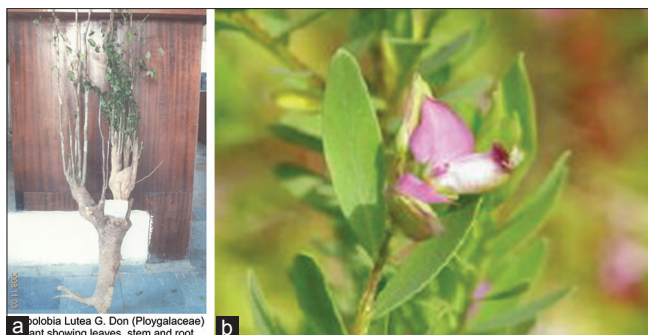
Figure 1: (a) Carpolobia lutea from forest natural habitat. (b) Flower of Carpolobia lutea G. Don (Abstracted from "Aphrodisiacs from Around the World" (juanwhite.com). Original illustration from flower wholesaler trade association

preliminary phytochemical screening of CL ethanolic leaf extract revealed alkaloids, saponins, tannins, anthraquinone, cardiac glycosides, and flavonoids. [33] Phytochemical screening of the root methanolic extract revealed the presence of tannins, saponins, flavonoids, cardiac glycosides, anthraquinones, and terpenes; alkaloids were absent. [34]