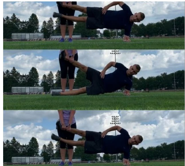
Figure 1. The Copenhagen adductor exercise. Top image shows the starting position, middle image shows the eccentric pelvic on femoral abduction phase, bottom image shows the concentric pelvic on femoral adduction phase.

The Quality Assessment Tool for Qualitative Studies has been shown to have fair inter-rater agreement for individ-