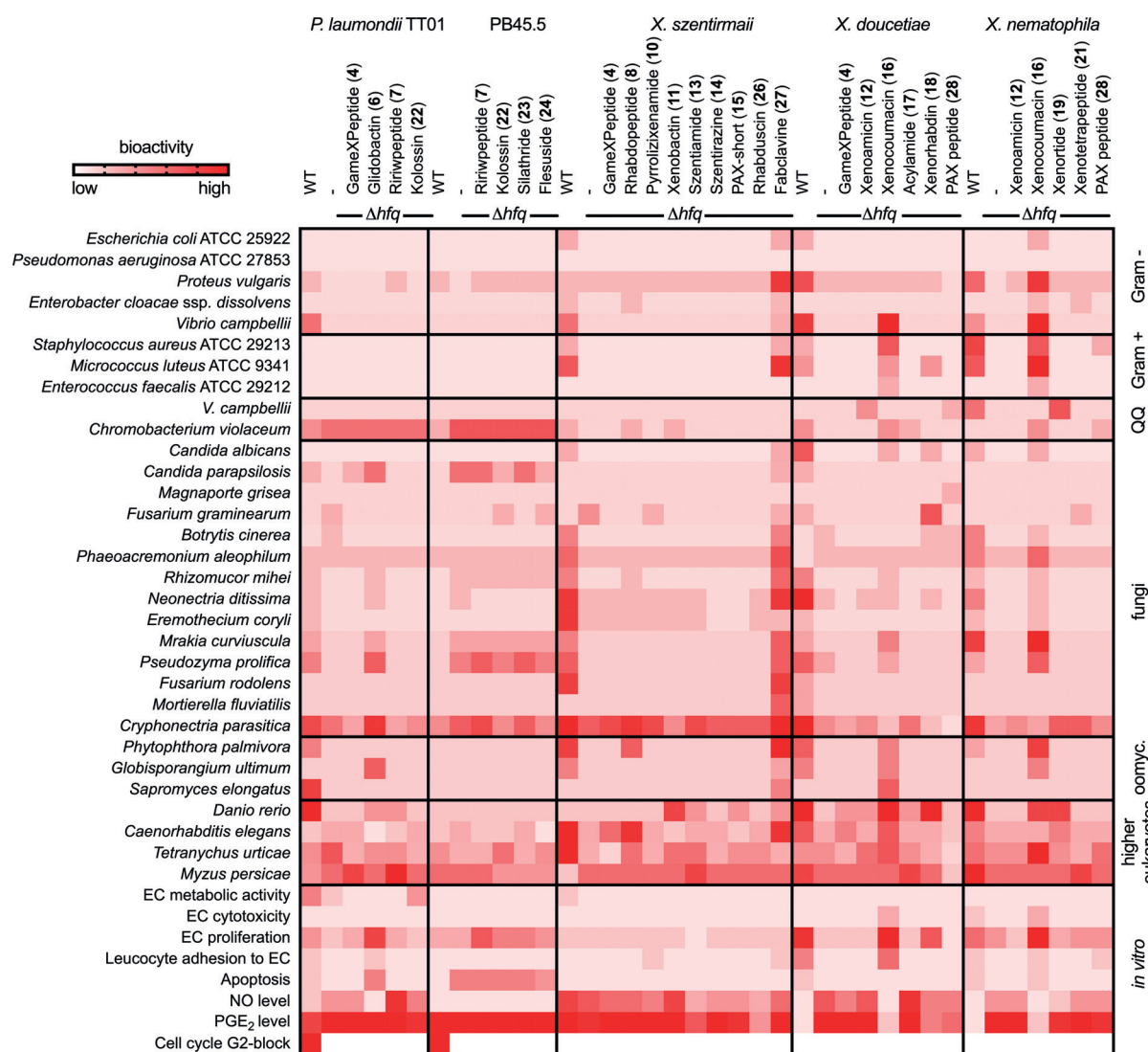
Figure 3. Bioactivity of cell-free culture supernatants enriched in desired NPs (top) derived from \Delta hfq - P_{BAD} - XY mutants against wild type (WT) or \Delta hfq alone against different organisms and in vitro assays. Bioactivities are shown for none (white) to highest activity (red) in the different assays (Supplementary Table 5). For NP data and structures see Supplementary Figure 1 and Supplementary Table 1.

strain showed high bioactivity against higher eukaryotes like zebrafish and nematodes exemplified by 16/18 and 16/19 in X. doucetiae and X. nematophila . In general, the bioactivity of two NPs in the same assay might point towards an important ecological role of these NPs to act synergistically in a well-defined (or concerted) mixture. The free-living stage of the nematodes carrying Photorhabdus or Xenorhabdus in their gut, infect insect larvae in the soil that are used as a food source and shelter for nematode development. To guarantee an undisturbed propagation, the insect cadavers must be protected by NPs delivered by the nematode symbiont against potential food competitors including also invertebrates and vertebrates. [19] Since many NPs are only produced in low amounts in the natural environment, [29] synergism might be an efficient way to potentiate the overall activity as previously shown also for clinically used drugs [30] while at the same time using less resources for NP production. Subsequently, activa-