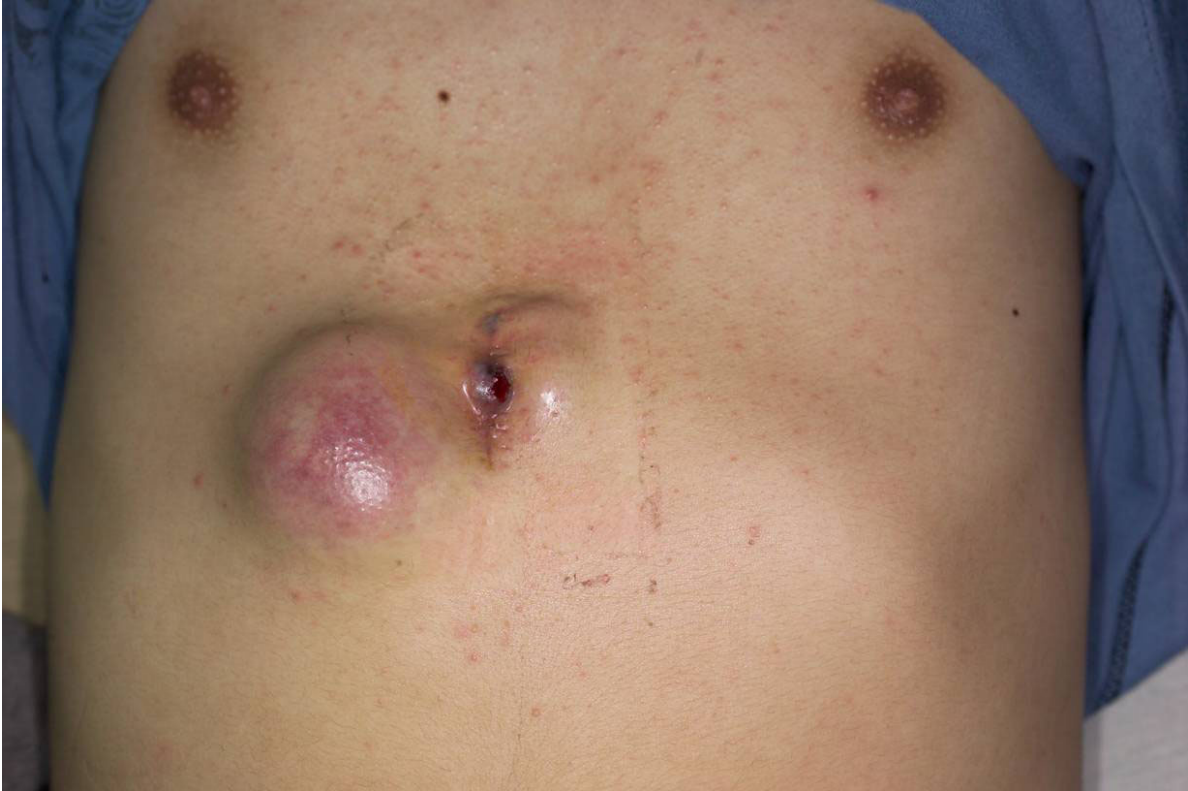
Figure 1 Two upper abdominal cutaneous nodules.