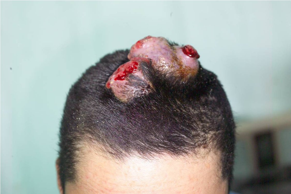
Figure 2 Multiple nodules at the scalp showing ulceration and mild bleeding on the top of each nodule.