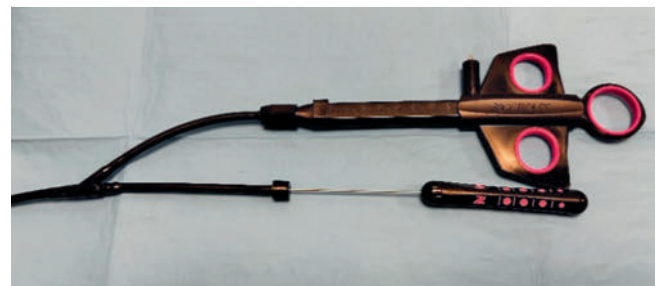
► Fig. 2 Independent handles: Three-ring hub maneuvering the loop and a stick moving handle maneuvering the basket.

Sixteen patients with WON who underwent EUS-guided drainage and DEN with Necrolit from January 2018 to August 2022 were included and data from them were analyzed (Necrolit group). These patients were compared with a control group of 16 patients who underwent EUS-guided drainage and DEN with standard, non-dedicated devices during the study period. According to international guidelines, WONs were treated in case