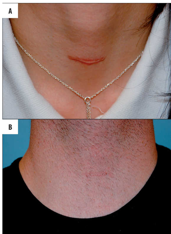
Figure 1. Postoperative photos of two MIT incisions which suffered mild hypertrophic scarring (A) and one that healed without incident (B).