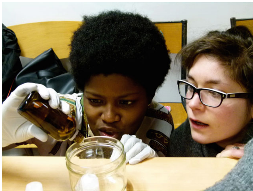
Fig. 9.4 Do-it-yourself preparation of make-up remover (See more images from Rios Sandoval’s fieldwork at https://www.chemicalyouth.org/#/projects/there-is-politics-in-your-shampoo )

Rios Sandoval describes how this highly interactive event, which traveled to many French university towns, warned youths about toxic chemicals hidden along the “ parcours de la drague ” (cruising route). The event was highly structured, with 15 minutes of sharing facts about the mechanisms and consequences of exposure to endocrine-disrupting chemicals, followed by theatrical sketches to engage the audience. The sketches played out practical solutions, such as a dazzling date with a meal free of pesticides, and condoms and self-made lubricants free of endocrine-disrupting chemicals. Rios Sandoval (2019) writes that her interlocutors “apprehend toxicity through the re-appropriation of production chains, a mutually triggered and reinforced process. Do-it-yourself practices are tools for young people to intervene in the toxic relations making up everyday toxicity” (p. 251) (Fig. 9.4).