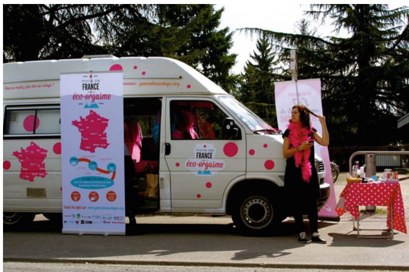
Fig. 9.1 The Éco-Orgasme tour, a youth-led campaign in France

concern deliberative acts of inhaling, swallowing, and injecting chemicals, as well as applying them to hair, faces, and bodies. We show that young people engage in such practices to achieve their aspirations for wellness and productivity at work, and that many of our interlocutors were not aware of how these practices simultaneously involve multiple, entangled toxicities. Two questions thread their way through this book: why do these youth trust that chemicals will not bring them harm, and what contributes to the relative invisibility of toxic risks?