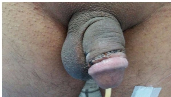
Figure 4. Second post-op day after repair of double penile fracture.

Penile fracture, or faux pas du coit , is an underreported but emergent urological condition 8 . It's underreported because many patients do not seek medical attention due to embarrassment, shame, or lack of guidance 3 . Activities that can result in penile fracture includes self-manipulation to achieve tumescence, sexual intercourse, turning over in bed, a direct blow to the erect penis and interrupting the erection due to a violent bending of their penis called "Taqaandan" 2,4,9 . The most common cause is sexual intercourse, with injuries often caused by different sexual positions. In an original article published in 2017, Barros et al. reported that 'doggy style' was more commonly associated with double fractures out of 67 patients (10%) presented double corpus cavernosum lesión 10 . In fact, any activity associated with tumescence can increase the chance of penile fractures. In 2002, Blake et al. reported the first case of a fracture related to pharmacologically induced erections 11 . The increased risk of penile fractures during tumescence is related to the tunica albuginea stretching and thinning. The thickness of the tunica reduces from 2.4mm, in the flaccid state, to 0.25-0.5mm in the erect form 12 .