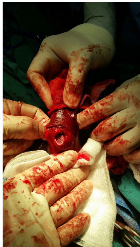
Figure 2. Exposure of one of the fractured corpora cavernosa after penile degloving during surgical treatment.