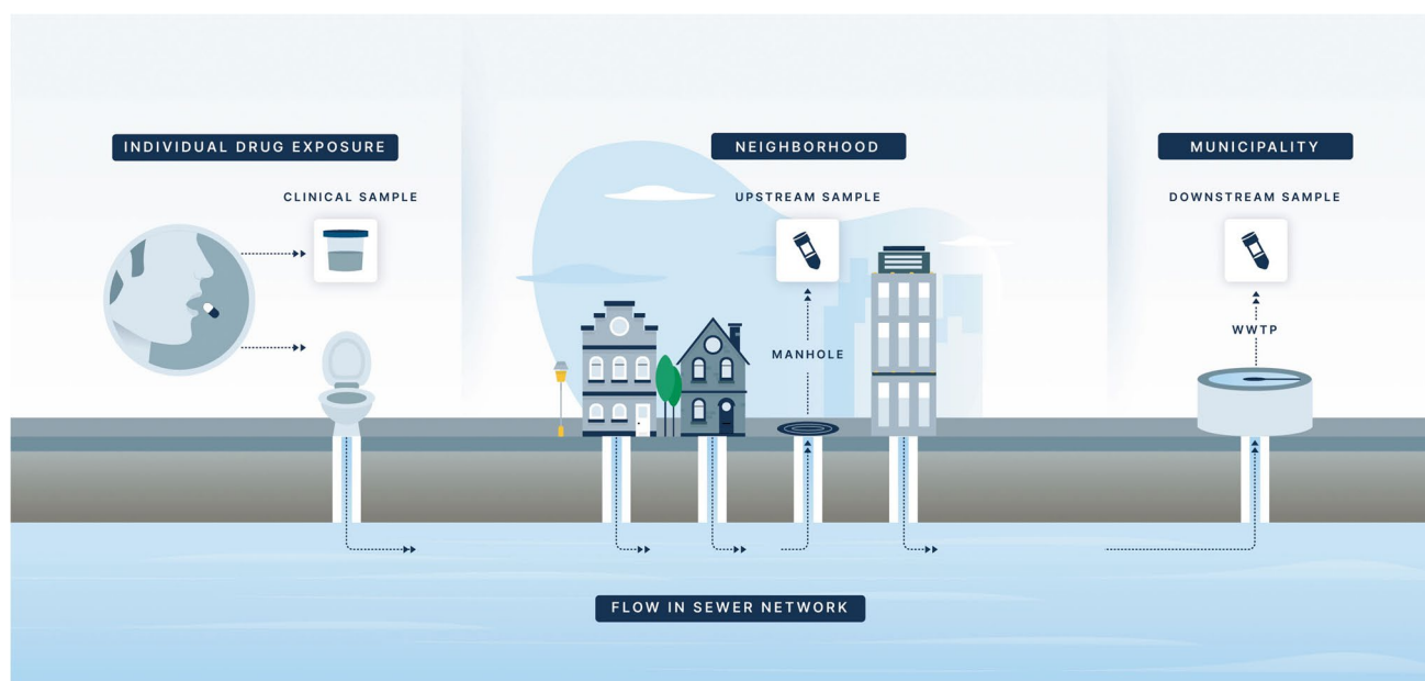
Fig. 2 Schematic of a wastewater treatment network with targeted upstream sampling and downstream testing. Analyses of wastewater at various access points within the sewer system can provide insights

into the population-level drug exposures within the area