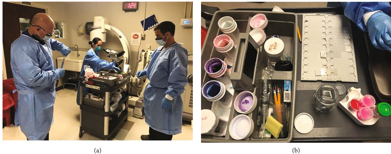
FIGURE 1: Rapid on-site evaluation.