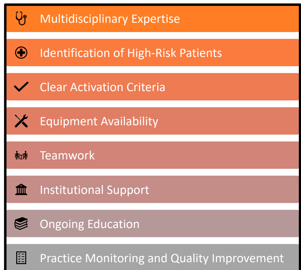
Figure 5. Key elements for effective airway response teams. Adapted from Bittner and Sharifpour [28].

Airway emergencies are common in the acute care setting and ineffective response is a source of preventable patient harm. Complications can be minimized by implementation of an ART program, which provides an organized, multidisciplinary, team-based approach to EAM. At a minimum, an effective ART includes a cohesive group of clinicians with airway expertise, including skills to perform FONA, and clear criteria for activation. By establishing clear criteria for activate an ART, educating clinicians to identify high-risk patients, ensuring equipment availability, optimizing teamwork, and providing education, the ART can improve care and create a safer environment for both patients and clinicians (Figure 5).