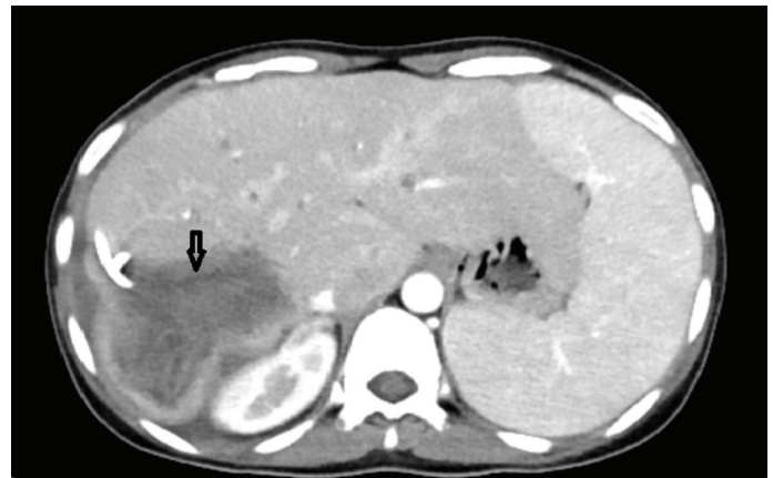
Figure 2. Hydatid cyst with PAIR catheter.

While vague abdominal pain is a common symptom associated with hydatid liver cysts, these cysts often remain asymptomatic and are typically discovered incidentally during patient examinations. Over time, the cysts gradually grow and become symptomatic when they rupture into the biliary tract, leading to obstructive jaundice. In some cases, the cysts may rupture spontaneously into the peritoneal cavity. [2] Laboratory tests in patients with uncomplicated cysts often yield normal results. However, when there is communication between the cyst and the biliary system, liver function tests and cholestasis enzymes may show elevated levels. Due to the non-specific nature of the symptoms and the limited information from history and physical examination, radiological imaging, such as ultrasound and computed tomography, is essential for accurate diagnosis. The radiological classification of hepatic hydatid cysts is based on the World Health Organization Informal Working Group on Echinococcosis and the Gharbi classification system. [3]