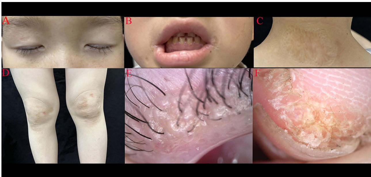
Figure 1 Physical examination revealed beaded papules on the upper eyelid margin (A), disordered arrangement of teeth and gingival hyperplasia (B), diffusely atrophic scar on the whole body (C), and brownish-yellow plaques on both knees (D), clustered light yellow oval structureless area on the upper eyelids (dermoscopy) (E), verrucous, keratinized, proliferative lesions around the nails (F).

Low-quality sequences were filtered using CutAdapter software ( https://cutadapt.readthedocs.io/en/stable/ ). The remaining reads were aligned to the human genome version hg19 using the BWA aligner ( https://github.com/lh3/bwa ). The annotation of SNPs and INDELS was performed using ANNOVAR ( https://www.openbioinformatics.org/annovar/ ), with a focus on mutation sites present at frequencies less than 0.02 in the normal database, which include data from the Thousand Genomes Project ( https://www.internationalgenome.org/ ), Exome Variant Server ( https://evs.gs.washington.edu/EVS/ ), and Exome Aggregation Consortium (EXAC) ( https://www.broadinstitute.org/exac ).