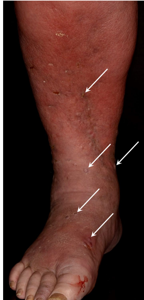
Fig. 1 Edema, erythema and small superficial abscesses (white arrows) on the lower right leg and foot

After 2 weeks, however, the patient was referred to our clinic, owing to the progression in his cutaneous symptoms. The patient then presented with a severely oedemic and painful lower right leg, with slight erythema and multiple small soft papules (Fig. 1). In addition, the whole skin of this extremity had a sponge-like feel to the touch. No notable symptoms were present on the left leg.