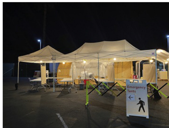
Figure 1. Two large disaster tents were erected outside of the main emergency department.

Because the tents were generally open from 12:00 PM until 9:00 PM, the area was prepared with space heaters and blankets for patients and staff to use during cooler hours, with outdoor lighting for darker hours, and with fans and ample drinking water to use during warmer hours. We did have some days of rain, which required us to keep electrical equipment off the ground and inside the waterproof tents during these periods as well as overnight. We had the distinct advantage, due to our location in California (coastal, western United States), of a moderate spring climate. Tents erected in other locations around