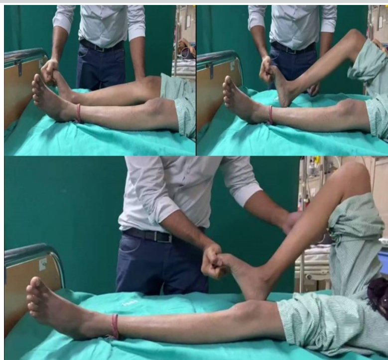
Figure 1: Stepwise elicitation of Yadav–Kunal reflex showing sequentially in figure–forced plantarflexion of toes leading to knee flexion in the same limb.