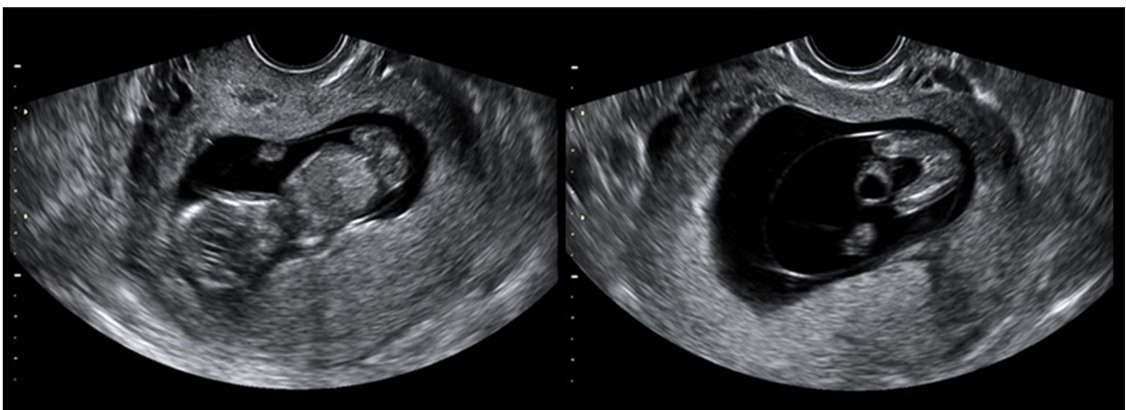
Figure 1. Fetal ultrasonography at 12 weeks and 4 days of gestation age. There was a cystic lesion at the fetal umbilical region.

Blood tests on postoperative day 4 showed hypothyroidism, so levothyroxine was administered. On postoperative day 5, the patient had abdominal distention, and abdominal X-ray images showed accumulation of small-intestinal gas. He was diagnosed with postoperative paralytic ileus, and an ileus tube was inserted. On postoperative day 8, the patient took oral feeding while decompressing with the ileus tube. The ileus tube was removed on postoperative day 30. After alleviation of the ileus symptoms, magnetic resonance cholangiopancreatography (MRCP) did not show the gall bladder clearly, but it did show dilatation of the biliary duct (Figure 3). The postoperative course was then uneventful, and hypothyroidism was well controlled with levothyroxine. The patient was discharged