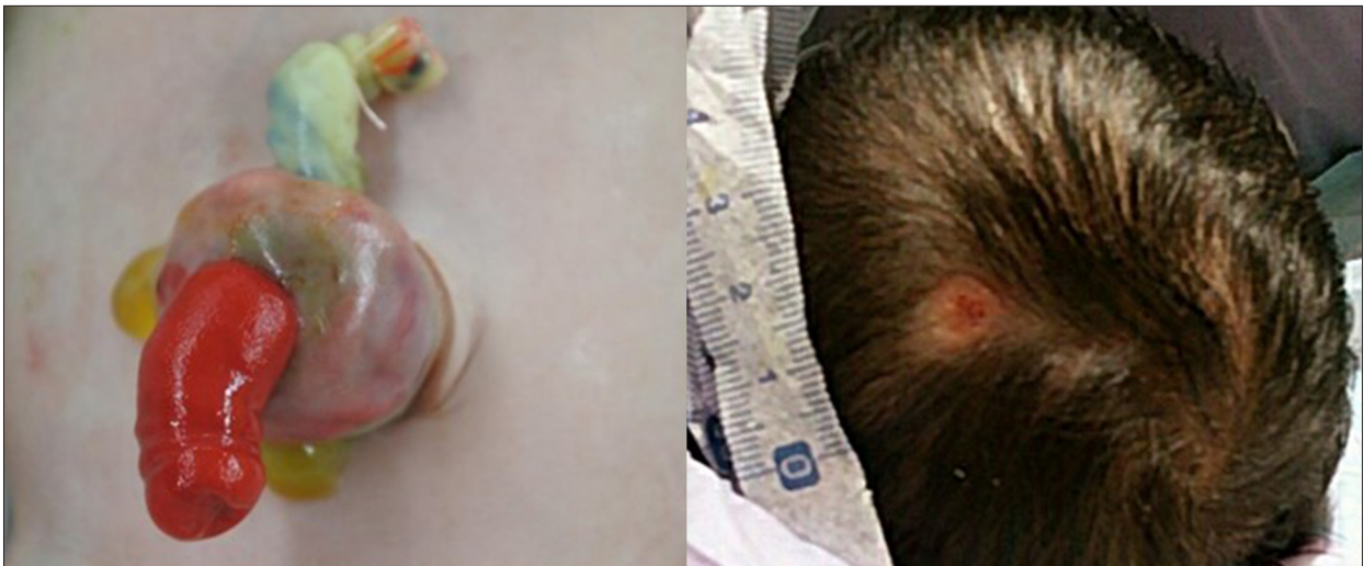
Figure 2. Physical findings at birth. Omphalocele with omphalomesenteric fistula protruded from the umbilicus, and there was a scalp defect on the head.