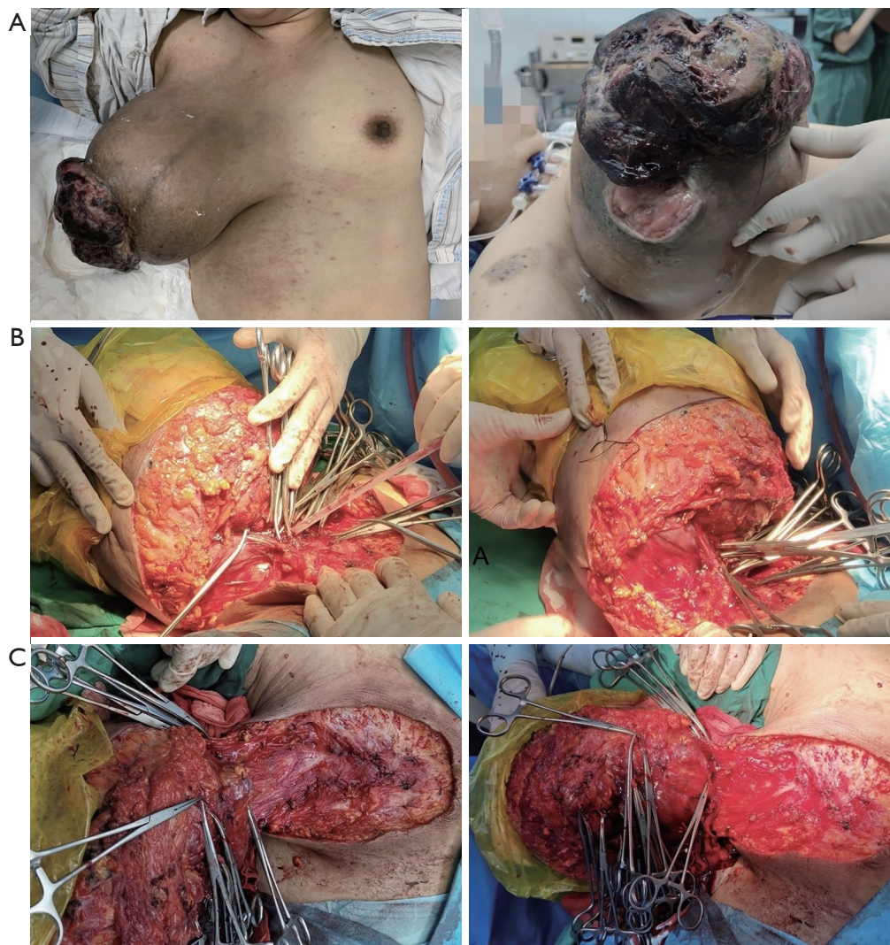
Figure 3 The operation process. Before the operation (A): When the patient entered the operating room, lying on the operating bed. Undergoing surgery (B): This patient underwent the right breast huge tumor radical resection.

confirming that there was no active bleeding, the wound is covered with hemostatic cotton to prevent further bleeding, and a drainage tube was placed on the inner side of the dry chest and under the armpits, connected to a disposable negative pressure continuous drainage device. After counting the number of pairs of gauze and instruments, the surgical port was closed with absorbable surgical sutures (imported fast forest), covered with sterile dressings, and the armpits were pressurized. The whole operation was smooth, and the anesthesia effect was good. The high-frequency electric knife and ultrasonic knife were used throughout the whole process. The vital signs of the patient were stable. The intraoperative infusion was 2,750 mL, the bleeding was 600 mL, and the