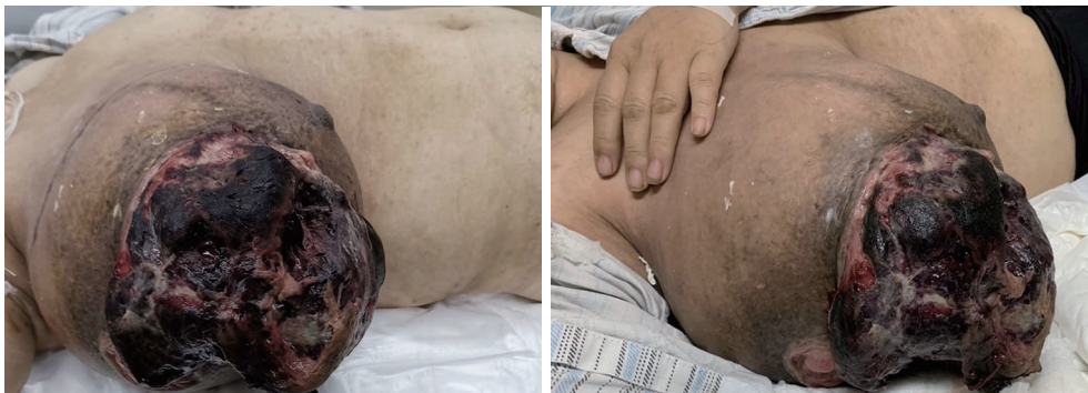
Figure 1 The patient's right breast tumor at the time of admission.