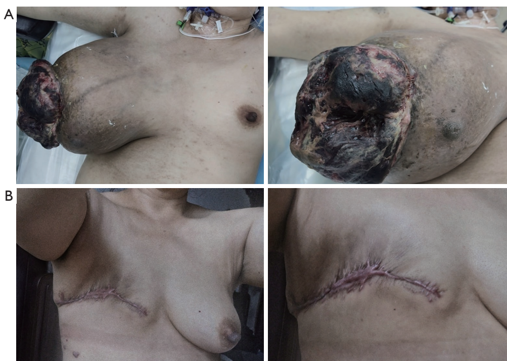
Figure 5 Comparison of patient's right breast before (A) and after (B) surgery.

long, is visible on her right front chest wall ( Figure 5B ). At the time of the reported case, the patient had been 4 months after surgery and was followed up for 6 months. Her condition was stable and remained no signs of clinical or imaging recurrence, and timely follow-up was carried out. The timeline of diagnosis and therapy is shown in Table 2 .