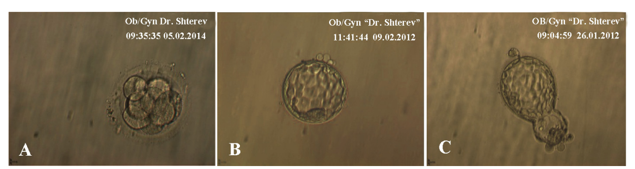
Figure 1. Images of high grade embryos, A: Day 3-8-cell embryo; B: Day 5-blastocyst; C: Day 5-hatching blastocyst

* Fresh or frozen ET procedures, ** High-grade embryos