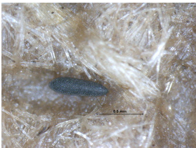
Fig. 2 Aedes japonicus egg on a wooden paddle from an ovitrap in Lower Austria