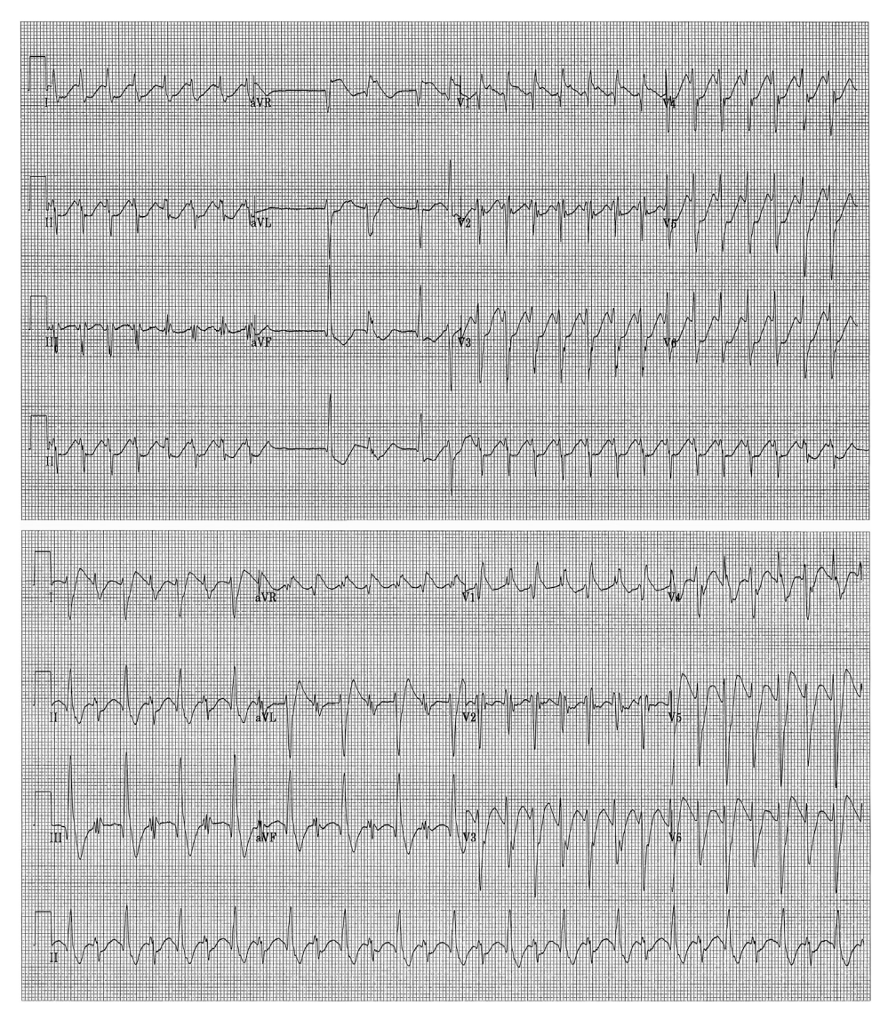
Figure 2 Development of sustained monomorphic (top) and bidirectional (bottom) ventricular tachycardia.

hypotensive and bradycardic actions of aconitine are attributable to central activation of the ventromedial nucleus of the hypothalamus.<sup>2</sup> The latter plays an important role in controlling autonomic nervous system activity and is associated with depression of the circulatory system, as seen in our patient presenting with vasodilatory shock. In addition, aconitine has a positive inotropic effect, also observed in our patient during ventriculography, related to prolonged sodium influx during the action potential owing to persistence of the open state.<sup>2</sup>