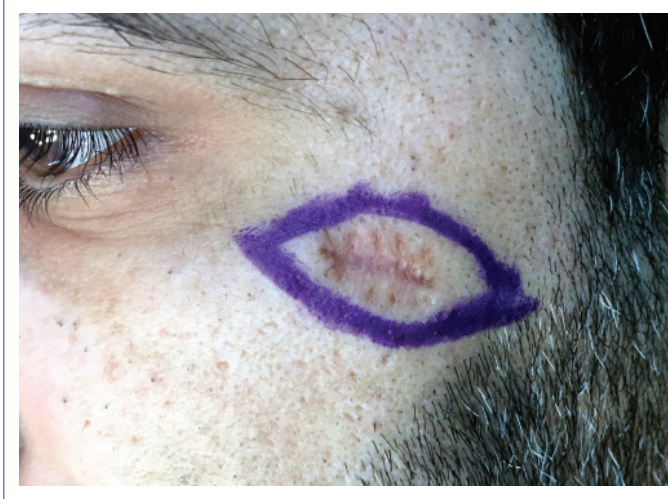
Figure 2. Preoperative surgical planning of re-excision in a patient with malignant eccrine poroma in the facial region.