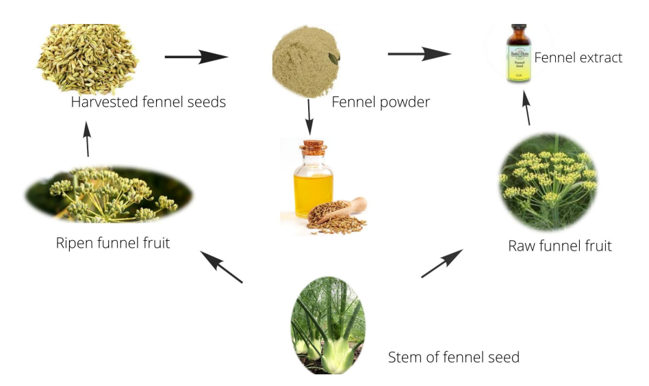
Figure 2. Different forms of fennel plants and seeds.

Fennel ( Foeniculum vulgare ) is a perennial herb native to southern Europe and the Mediterranean region that grows upright. The plant has yellow blooms on a complex umbel and grows to about 1.5 m tall. Different forms of fennel plant and seeds are given in Figure 2.