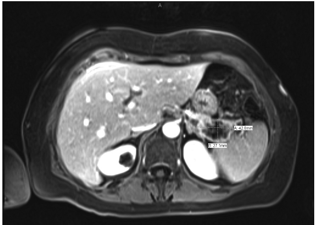
FIGURE 2: Magnetic resonance imaging demonstrating adenocarcinoma (27.1 mm X 42.8 mm) in the tail of the pancreas