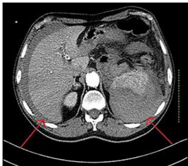
Fig. 1. CT scan of the abdomen. Perisplenic and perihepatic haematoma due to splenic injury (red arrows).