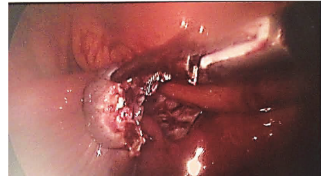
FIGURE 3: Right fallopian tube after salpingectomy.