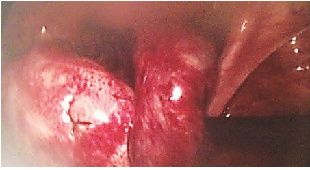
FIGURE 1: Left hematosalpinx.