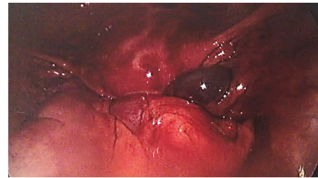
FIGURE 4: Laparoscopic picture of the tissue from the left fallopian tube.

interrupted midline echo, and no free fluid was noted. A diagnosis of pregnancy of unknown location was made but a complete miscarriage was suspected. Subsequently, serum beta-hCG and serum progesterone levels were checked to correlate with the clinical picture. She was offered pain relief and she was advised of admission due to her pain, both of which she declined. The patient was advised to return in 48 hours for repeat blood tests. A normal rise in serum beta-hCG levels from 618 IU/L to 1290 IU/L over a 48-hour interval was noted.