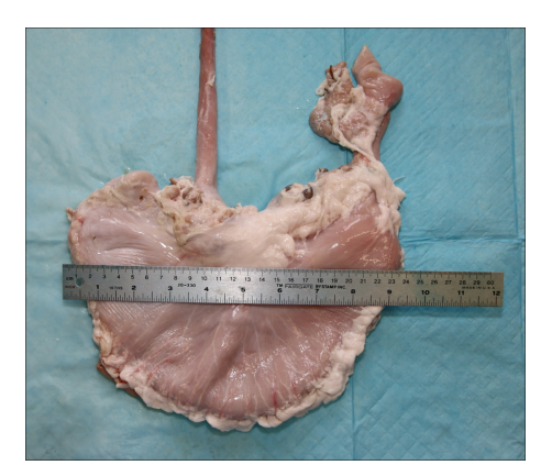
FIGURE 1: Measurement of horizontal length of stomach.

2.3. Efficacy of the Endoscopic Fundoplication. Efficacy of the procedure was assessed by gastric yield pressure (GYP) and gastric yield volume (GYV) [13, 14]. To measure GYP and GYV, 18-gauge cannula was inserted into stomach lumen, which was connected to a pressure transducer (Propaq<sup>®</sup> Encore; Welch Allyn, NY, USA). The pylorus was tightly closed around the tubing of the roller pump and the stomach was gradually filled with methylene-dyed normal saline using