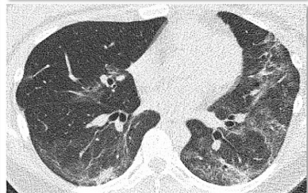
FIGURE 1: Imaging findings of COVID-19 pneumonia

(A) Chest X-ray (upper) and non-contrast computed tomography (CT) (lower) showed multifocal ground-glass opacities with consolidation in the bilateral lungs on admission. (B) Findings of chest X-ray (upper) and non-contrast CT (lower) ameliorated after the treatment of COVID-19 (on day 19).