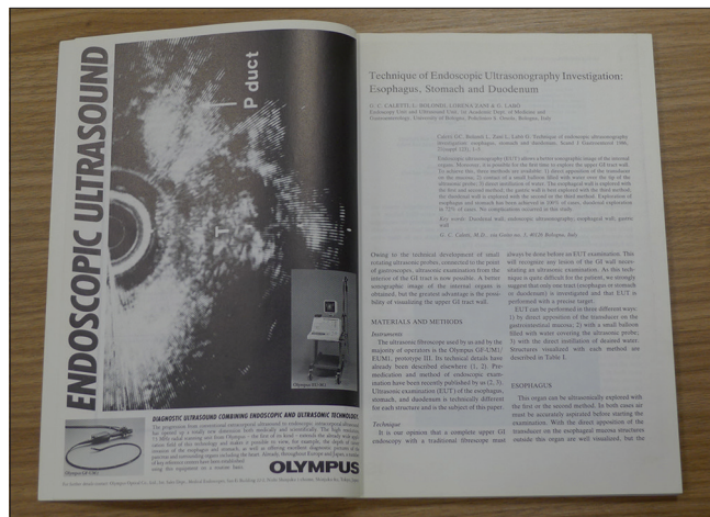
Figure 2. Among the earliest publications in EUS were reports about the gastrointestinal wall layer structure

As far as rectal cancer staging was concerned, we found it easier to reach the sigmoid colon with the GF-Y0016-UE than with the GF-UE160-AL5. Visualization through the sigmoid is essential for iliac lymph nodes detection to perform a complete locoregional staging. We also noticed that overall endoscopic exploration and the visualization of the papilla of Vater had improved thanks to the greater maneuverability of the echoendoscope, thereby potentially reducing the need for resorting to esophagogastroduodenoscopy before EUS.