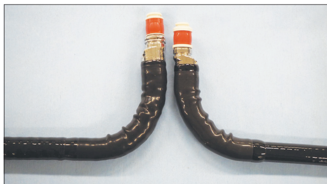
Figure 1. Head-to-head comparison of the new GF-Y0016-UE (right) with the GF-UE160-AL5 (left). Notice the shorter bending section of the new echoendoscope