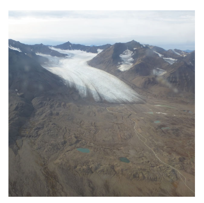
Figure 1. Aerial photograph of the forefield of Midtre Lovénbreen, a retreating valley glacier in Svalbard. For scaling purposes, the proglacial lakes vary between roughly 40-100 m in length.

method, taking a transect perpendicular to the snout of a receding glacier and using a space-for-time substitution, the development of recently exposed to established soils further from the ice-front can be characterized. This review covers the current body of work in deglaciated forefields in polar and alpine regions, and outlines suggestions for future research. Section 2 describes the major trends in the existing literature on forefield development, nutrient cycling and microbial communities. Section 3 considers the techniques employed in field studies to characterize soil microbial communities. Section 4 introduces the importance of seasonality of polar soils. Section 5 draws attention to model development and a greater understanding of the processes that dominate these ecosystems. Newly exposed glacier forefield ecosystems will become much more expansive with continued ice retreat in a warming climate. Hence it is imperative to understand and predict how these ecosystems will develop in the future.