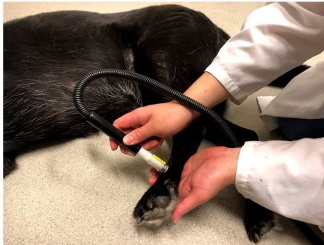
Figure 3. Application of the thermal test stimulus using the Physitemp NTE-2A at 49°C.

TQST. The TQST device (NTE-2A; Physitemp Instrument, Clifton, NJ) had a 13 mm tip connected to a recirculating pump with a combined reservoir that has digital temperature control (Fig. 3). The temperature of the probe can be altered between 0–50 °C, maintained to within 0.1 °C. It delivered a thermal stimulus for a maximum of 20 s using a probe at 49°C.