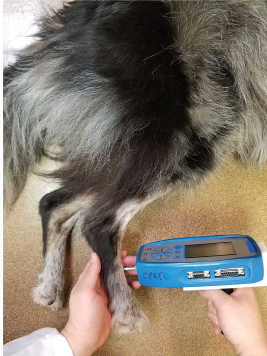
Figure 2. Application of the mechanical test stimulus using the Bioseb algometer.