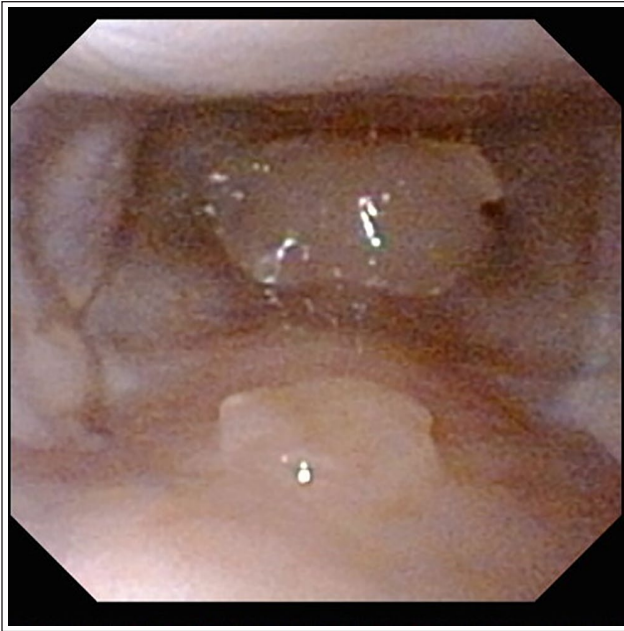
Figure 1 Before debulking, a large cryptococcal granuloma was noted arising from the floor of the nasopharynx, on the anterior-most aspect of the soft palate. Dorsal to the larger lesion was a smaller, similar appearing lesion, likely also a fungal granuloma. In these retroflexed endoscopic views, ventral is at the top of the image and the left side of the patient is the right side of the image

through both nostrils was noted. Tests for feline leukemia virus antigen and feline immunodeficiency virus antibody were negative (IDEXX FeLV RealPCR Test/IDEXX FIV RealPCR Test).