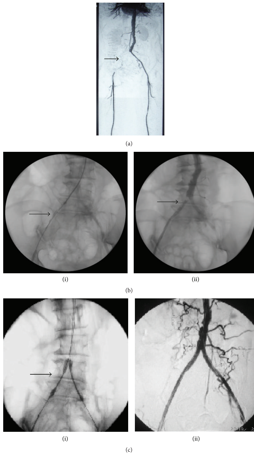
FIGURE 1: Case (1): stenting for a female PAD patient of 69 years. (a) CTA showed severe right iliac artery occlusive lesions about 12 cm (arrow). (b) (i) Thrombolysis by catheter (arrow). (b) (ii) Two days later, angiogram showed right iliac artery occlusive lesion changed from TASC II D to B (arrows). (c) (i) Endovascular angioplasty by Kissing-stenting (arrow). (c) (ii) Excellent result at right iliac artery.