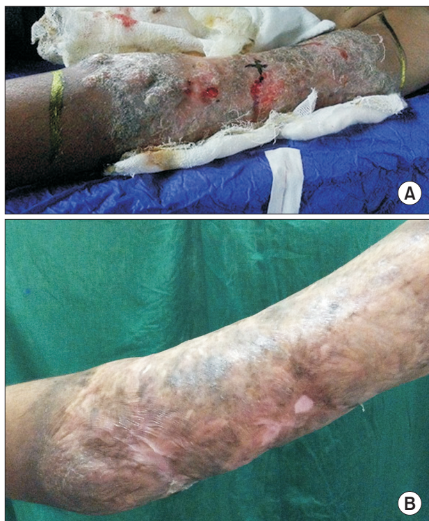
Fig. 1. (A) Pre-treatment photograph showing involvement of the entire circumference of the arm with extensive ulcero-nodular skin lesions with diffuse scaling, bleeding and crust formation. (B) Post-treatment photograph showing complete resolution of the skin lesions.

as a small nodule first noticed by him about 6 years ago and recurred despite repeated excisions, each recurrence being more extensive and aggressive than the previous. Histopathological evaluation suggested nonspecific inflammatory lesions. There was no history of any precipitating factors.