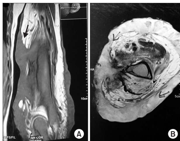
Fig. 2. (A) Coronal (T1-weighted) and (B) axial (T2-weighted) magnetic resonance images showing locally invasive cutaneous and subcutaneous lesion along the middle and lower third of left upper arm reaching up to the shaft of the humerus with dense periosteal thickening.

Excision of the lesion with skin grafting was performed. Histopathological examination of the excised specimen revealed regular acanthosis of keratinized stratified squamous epithelium with elongation of rete pegs. Superficial dermis showed diffuse infiltrate with inflammatory cells. Deep dermis showed sheets of lymphoid aggregates along with tangible body macrophages. There was destruction of adnexal