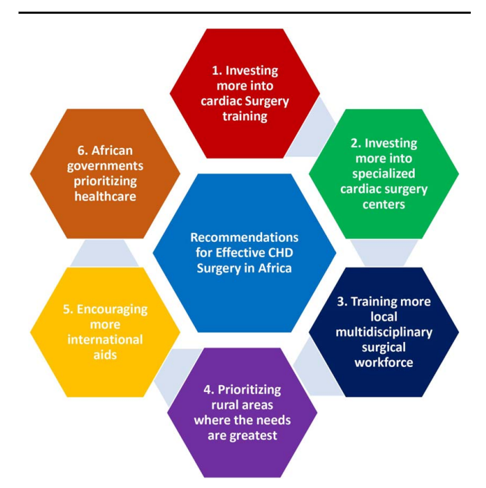
Figure 3. Recommendations and Strategies to Improve Congenital Heart Disese Care in Africa.

Another noteworthy project is the extensive work of the Italian nongovernmental organization (NGO) Associazione Bambini Cardiopatici nel Mondo, which has constructed more than two pediatric tertiary cardiac centers in Africa and trained local experts in collaboration with the UK-based NGO Chain of Hope<sup>[7]</sup>. Through twinning agreements and short-term staff exchanges, Children's Heartlink, a distinct nonprofit organization headquartered in the USA, has also worked with various African cardiac hospitals to train staff and specialists<sup>[7]</sup>. Additionally, a partnership between Uganda and the Children's National Medical Center in Washington, DC, has allowed for the resolution of many congenital cases<sup>[6]</sup>. All these efforts have helped save thousands of lives and improve treatment outcomes for CHDs on the African continent.