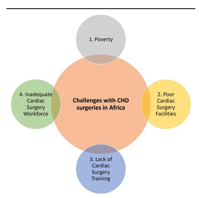
Figure 2. The major obstacles to congenital heart defects surgical delivery in African countries.

warranted. The National Surgical, Obstetric, and Anesthesia Plans (NSOAP) structure has been introduced to healthcare systems globally, but particularly in LMICS, in order to guide and enhance strategy plans<sup>[9–11]</sup>. Up until 2021, only six African nations; Zambia, Tanzania, Senegal, Ethiopia, Nigeria, and Rwanda, had developed and hoped to adopt NSOAPs, with