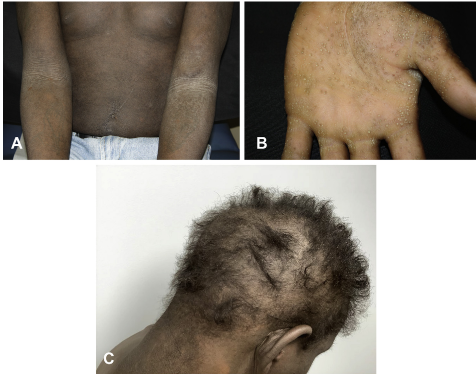
Fig 1. Clinical features. A , Diffuse lichenified and hyperpigmented patches involving the trunk and bilateral extremities. B , Keratotic papules and pits involving the palmar surfaces. C , Patchy moth-eaten alopecia with perifollicular keratotic papules present on the back of the neck.