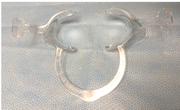
Fig. 2. Horseshoe-shaped plastic lip and cheek retractors.

Thorough patient assessment, proper medical documentation, and appropriate diagnostic testing are critical components of OMS practice to ensure proper diagnosis and treatment planning. OMSs should obtain patients’ medical histories in a similar manner as they would during in-office visits. New patients must be asked for comprehensive histories that include the chief complaint, history of the present illness, past medical history, past surgical history, dental history, medications, allergies, pertinent family history, social history, and a complete review of systems. For patients on record, medical histories should be updated to reflect the current chief complaint. All patients should also be screened with an up-to-date COVID-19 questionnaire. If an infection is suspected, OMSs should