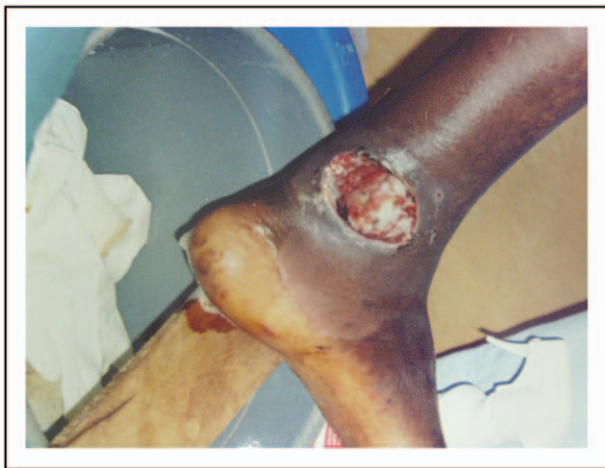
FIGURE 7. Buruli ulcer in a man from Ivory Coast (Courtesy of Dr Antonella Bertolotti).

A mobile application may be used in cases with possible disease [74]. Prompt laboratory-confirmed diagnosis is a main goal of WHO 2030 targets [77]. A rapid diagnostic tool is IS2404 PCR. The test is supported by WHO in African endemic regions to limit misdiagnosis and diagnostic delay [64]. Direct