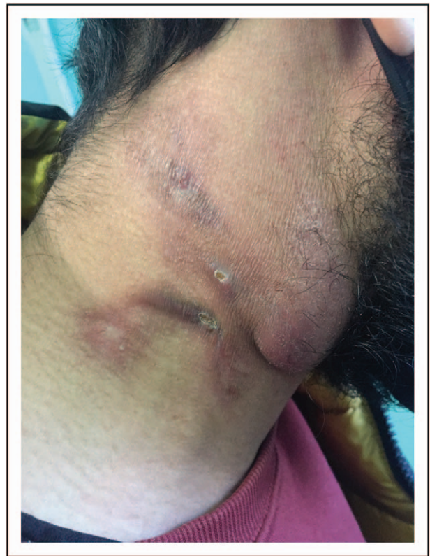
FIGURE 3. Lymph nodal and cutaneous tuberculosis in a man from Morocco.

Haematogenous or lymphatic dissemination accounts for the majority of cutaneous cases of TB. Among them, lupus vulgaris is a chronic, progressive, postprimary form of CTB, following a regional lymphatic or blood stream spread in individuals with moderate or high level of TB immunity [17 ¶ ]. Various clinical forms are observed: papular, nodular, with plaques, vegetative, ulcerative, mutilating, hypertrophic, atrophic, tumour-like type [17 ¶ ]. The buttocks and the extremities are usually involved in tropical and subtropical settings, face and neck in the West [17 ¶ ]. Ramesh et al. [10] recently described an Indian case series of lupus vulgaris affecting the pinna [10]. Family history of lupus vulgaris has been described in high endemic areas [17 ¶ ]. Main differential diagnosis include leprosy, sarcoidosis, discoid lupus, leishmaniasis [17 ¶ ]. Acute miliary skin TB and gummatous TB are more commonly seen in patients with immunosuppressive disorders (i.e. AIDS, users of tumour necrosis factor alpha antagonists) [18].