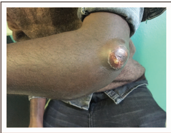
FIGURE 2. Bone and cutaneous tuberculosis in Ethiopian migrant.

CTB from an endogenous source, also known as 'scrofuloderma', originates from a contiguous tuberculosis focus (e.g. lymphadenitis, osteomyelitis, epididymitis), which spreads to the overlying skin leading to local tissue destruction (Figs. 2 and 3). Neck, axillae, groin and chest are the most commonly involved sites [15]. Orificial TB (or TB cutis orificialis ) is a rare postprimary CTB caused by auto-inoculation of mycobacteria in middle-aged to elderly patients with advanced forms of lung, intestinal or genitourinary TB [16]. Lesions appear more frequently in oral mucosa, but the perianal area can also be affected [16]. Differential diagnoses of perianal ulcers include inflammatory processes (e.g. Crohn's disease), neoplasms, sarcoidosis and sexually transmitted diseases [16].