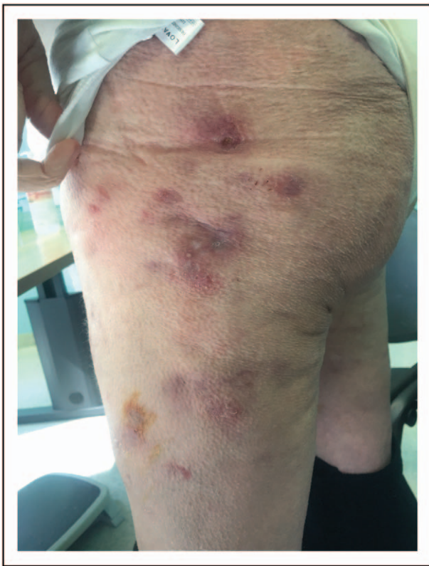
FIGURE 6. Disseminated skin infection by M. chelonae in immunocompromised woman.

virulence and host immune status [55]. Immunocompromised individuals are more susceptible to less pathogenic NTM (i.e. M. haemophilum ) and dissemination (cutaneous and/or subcutaneous and/or systemic) (Fig. 6).