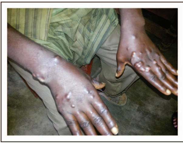
FIGURE 5. Lepromatous leprosy lesions on the hands.

Neelsen staining [27,36]. Calculating the bacillary index on a biopsy allows to establish whether the disease is multi or paucibacillary and determines the treatment.