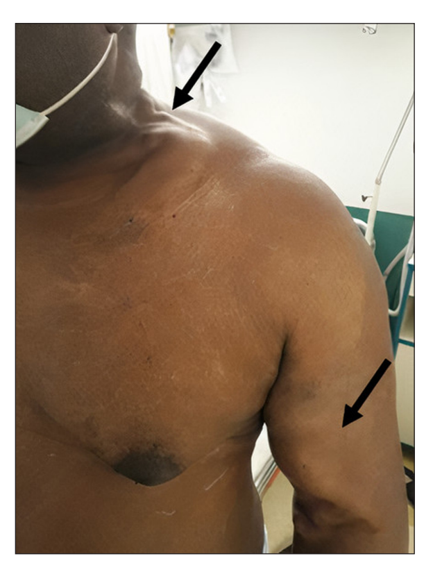
Figure 1 Aneurysmal brachiocephalic arteriovenous fistula and prominent axillosubclavian and external jugular veins in the left extremity.

Physical examination revealed a large aneurysmal brachiocephalic AVF, and prominent deep veins over the upper arm and shoulder in the left extremity ( Figure 1 ). Duplex ultrasonography showed acute thrombosis of the proximal segment of the left subclavian vein, patent AVF with flow volume of 800 mL/min, and blood return from the AVF travelling up in a retrograde fashion through the left external jugular vein. Computed tomography (CT) confirmed the central venous thrombosis and significant retrograde dilatation of the left axillosubclavian and external jugular veins ( Figure 2 A, B ), with retrograde flow