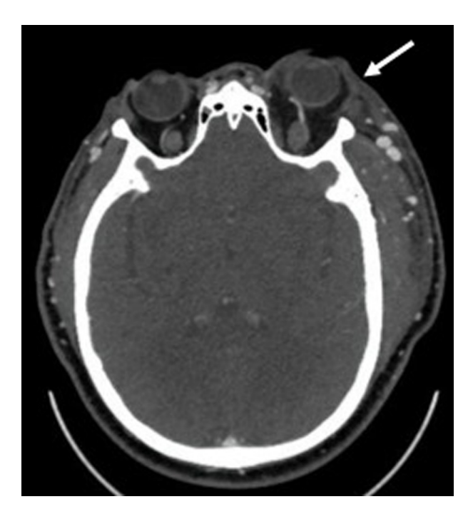
Figure 3 Computed tomographic image shows dilatation of the left superior ophthalmic vein and proptosis of the left eye in relation to an increased retrograde venous flow.

in the cavernous sinus and superior ophthalmic vein and subsequent proptosis of the left eye ( Figure 3 ). Laboratory findings were within normal limits, including a complete blood count, a coagulation profile, and comprehensive metabolic panel.