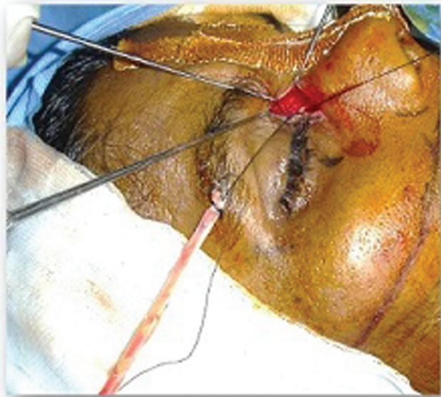
Fig. 2 Suture threads tunneled under medial canthus help pull the fascia lata graft in place.

mid part of temporalis muscle is isolated, divided, and dissected as before. A broad long strip of fascia lata is divided into four strips with one end undivided. An incision is made in nasolabial groove, just outside the angle, over the philtral column, midline of lower lip at labio-mental groove and junction of ala with face. Fascial slings are tunneled from nasolabial area to these sites and broader undivided end tunneled proximally to temporal area. The fascial sling to the lower lip is sutured first across the midline into muscle; then pulling at the undivided end and maintaining same tension, other slings are sutured to angle, and upper lip, using 4-0 nylon and the incisions