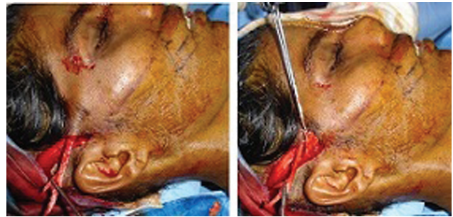
Fig. 4 The fascia lata grafts are fixed in a retrograde fashion to the temporalis tendon with adequate tension just enough to close the eye.